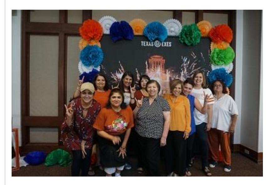
Fiesta Committee setting up before the event

special raffle was held for a prototype of the Longhorn Loteria game being developed to benefit the Texas Exes Hispanic Alumni Network's scholarships.