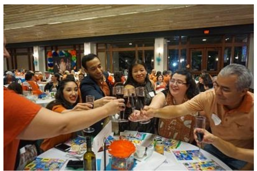
The "Brindis" table celebrating the evening's success